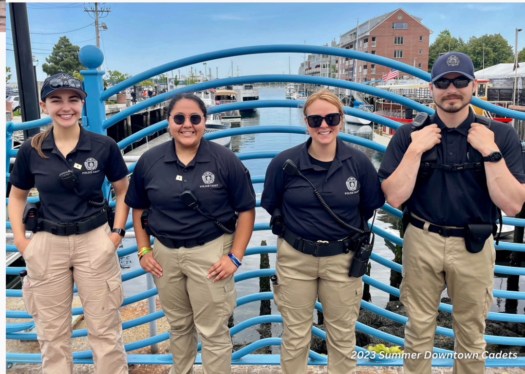
2023 Summer Downtown Cadets

Our annual 207 Day Scavenger Hunt encouraged exploration during one of downtown's colder, quieter months. Participants completed Maine-themed tasks, including writing "Love Notes" to downtown businesses, spreading warmth and appreciation throughout the district.