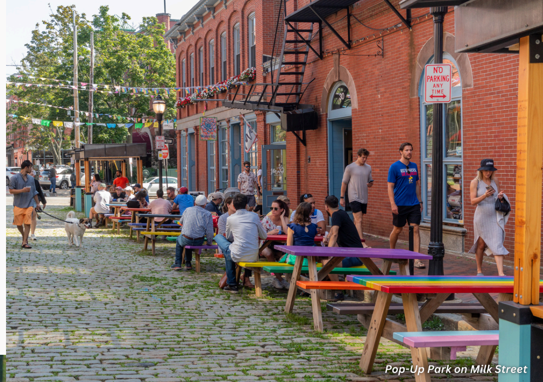
Pop-Up Park on Milk Street

Recognizing that increased restroom accessibility in our downtown area will contribute significantly to its cleanliness and overall vibrancy, we collaborated with other organizations to write the "Public Restroom Master Plan for Portland's Downtown District," a guide to the placement, design, and management of future public restrooms in our footprint.