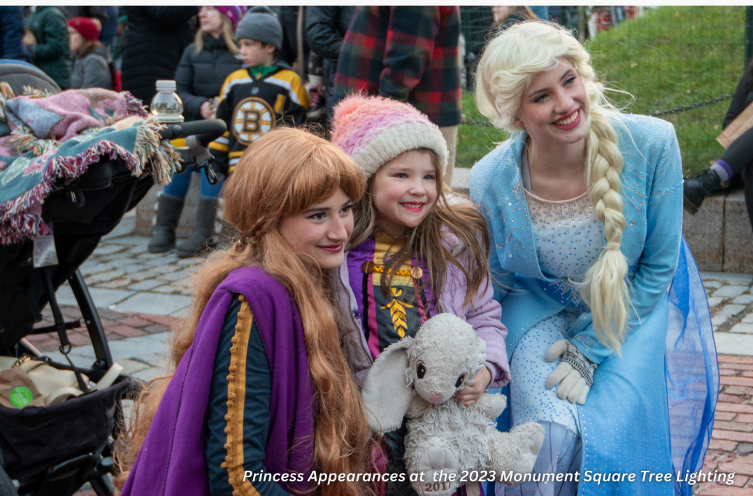
Princess Appearances at the 2023 Monument Square Tree Lighting

At Monument Square, we spruced things up with new seating, planters, and a weekly makers market where local artisans showcased their talents. And even though we faced a few challenges, our 'Open Streets' initiative on lower Exchange Street aimed to turn that area into a pedestrian-friendly zone on summer Sundays, fostering a more inviting urban environment for guests and local alike.