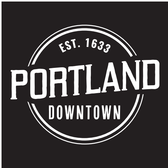
Reverse (White): To be used over dark backgrounds