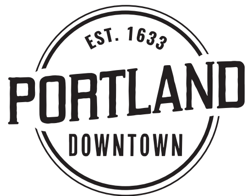
One Color (Black): For black+white applications, etc.