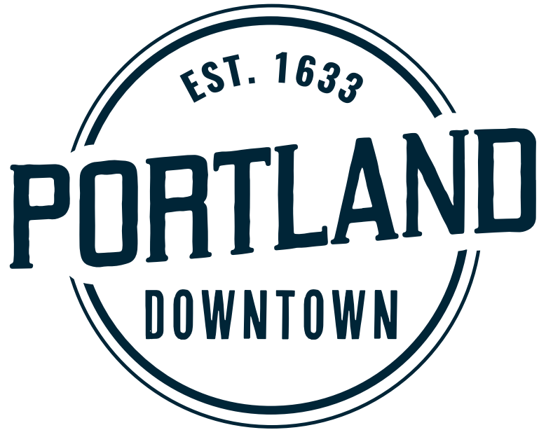
Primary Logo, PMS 303 C